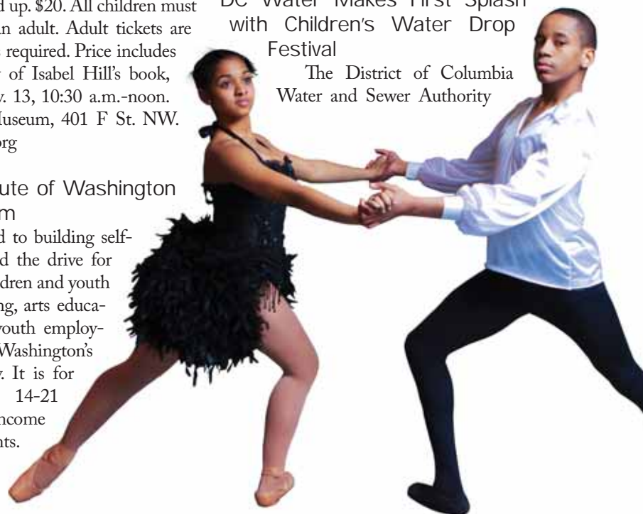
The Dance Institute of Washington In-School Program dancers.

The District of Columbia Water and Sewer Authority