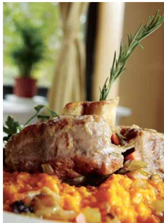
Served with a robust tomato sauce, osso bucco (veal shank) is a favorite fall dinner entree.