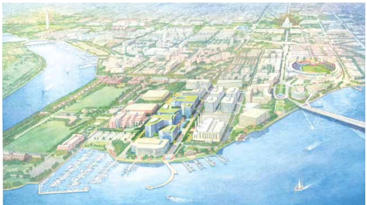
The 100 V Street project planned by developer Akridge is represented by the buildings with the green roofs. If DC United built a stadium at the site instead of the initial plan for a secure federal campus, it would be only a few blocks from Nationals Park.

Despite the vague comments from both parties, it appears that Buzzard Point is one of the top contenders for a new stadium to replace DC United's current home at Robert F. Kennedy Stadium, which is an aging facility surrounded by parking lots on federal land along the banks of the Anacostia River. Several MLS franchises have built new soccer-specific stadiums in the past few years, including the New York Red Bulls,